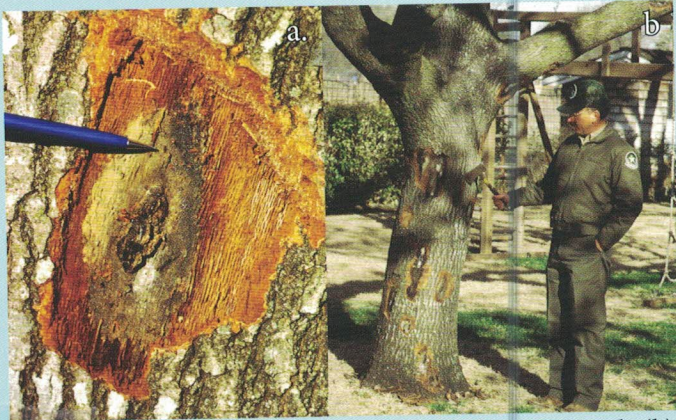
Figure 3 – (a) exposed fungal mat on Buckley (Spanish) oak; (b) multiple oak wilt fungal mats on dead red oak.

live oaks in Texas expand at an average rate of 75 ft per year, varying from no spread to 150 ft in any one direction. Occasionally, the oak wilt fungus is transmitted through connected roots between red oaks, but movement through roots is slower in red oaks and occurs over shorter distances than in live oaks.