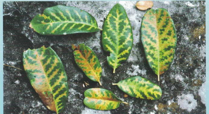
Figure 2 - Live oak leaves showing oak wilt symptom known as veinal necrosis.

Oak wilt diagnoses may be confirmed by isolating the fungus from diseased tissues in the laboratory. Samples can be submitted to: Texas Plant Disease Diagnostic Laboratory, 1500 Research Parkway, Suite A130, Texas A&M University Research Park, College Station, TX 77845. A county extension agent, Texas A&M Forest Service forester, or trained arborist should be consulted for proper collection and submission of samples.